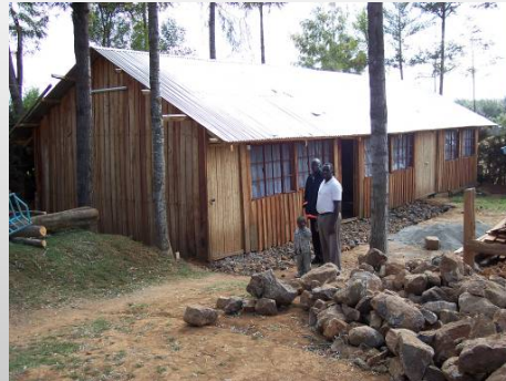
PAST CLASSROOMS & LIBRARY

We were also grateful to the Lord for providing a partnership with South African Theological