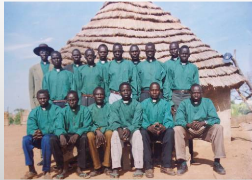
PASTORS OF THE AKON ARCHDEACONRY ANGLICAN CHURCH OF THE SUDAN (ACS)

I quickly came to know the love and mercy of Jesus Christ. On November 27, the week after I became saved, I was bit by a poisonous snake at night while I slept. Though I lost consciousness and should have died, the Lord